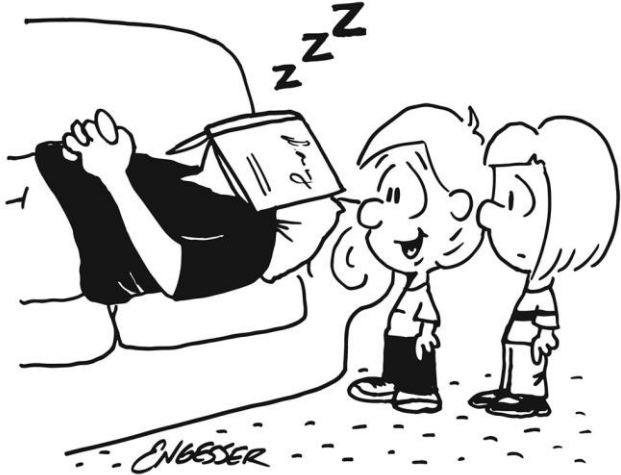
"He's using the devotional we gave him for Father's Day."