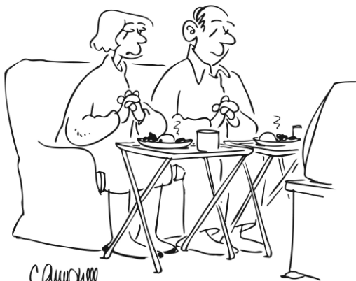
“Please bless these chops, these peas and these potatoes, both actual and couch.”