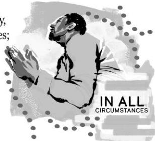
Answer: C (See 1 Thessalonians 5:16-18, NIV)